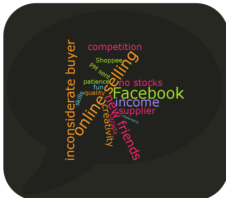
Fig. 2. Visual illustration of the various experiences and challenges on online selling

In this time of pandemic when there are restrictions on the movement of people, online selling is getting its essential plot in the marketing world. Though online selling that is done through a social media platform such as Facebook was seen to be advantageous since it could cater almost everything that people need, online sellers still find it challenging .