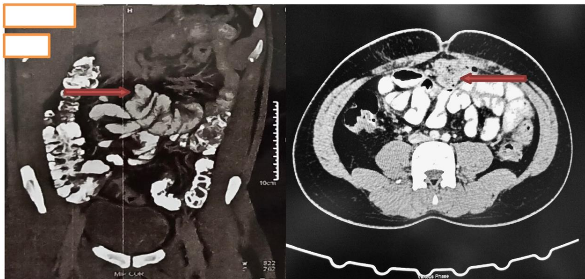
Fig. 1. Dilated small bowel loops (coronal & axial section)

Routine hematological investigations did not reveal any abnormality. The chest X-ray was normal and did not reveal free gas under the domes of the diaphragm. Contrast enhanced CT (CECT) scan of the abdomen was suggestive of sac-like mass with dilated small bowel loops between the stomach and pancreas in the left hypochondrium (Fig. 1). The sac containing a small bowel was displacing the transverse colon anteriorly and splenic flexure of the colon inferolaterally. These findings were suggestive of a left PDH.