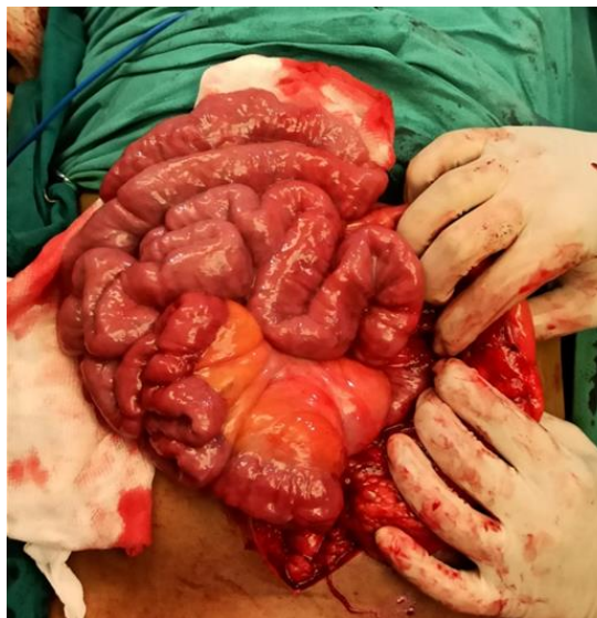
Fig. 3. Small bowel loops taken out of the hernial sac