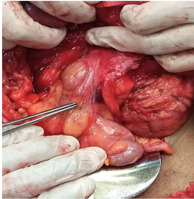
Fig. 4. Congenital bands noted