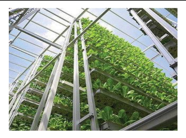
Fig. 2. Shows the rotating tower system used by Sky Greens