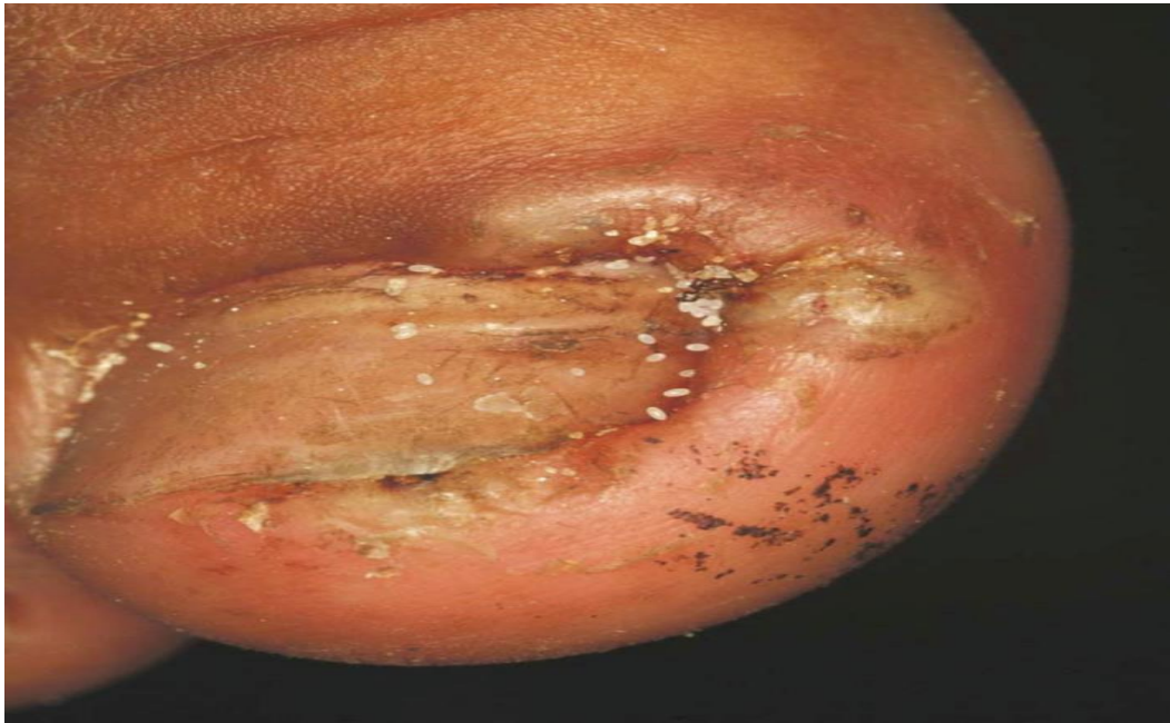
Fig. 4. Several vital tungiasis lesions on the first toe [4]

In certain situations, when the diagnosis is uncertain or atypical presentations are encountered, additional diagnostic techniques may be employed. These can include the use of microscopy to examine skin scrapings or tissue biopsies, which can reveal the presence of flea parts, eggs, or secondary bacterial infections [8]. Polymerase chain reaction (PCR) techniques can also be utilized for molecular identification of the parasite in challenging cases [18].