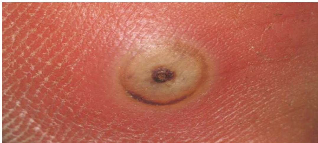
Fig. 3. Single lesion caused by a mature flea [4]

Diagnosing tungiasis is primarily based on clinical examination and identification of the characteristic lesions. Visualization of the flea within the skin, including the central punctum and whitish halo, is highly indicative of the disease. Dermoscopy can be a useful tool to aid in the visualization of the flea and its associated structures [17]. In cases where the flea is not visible, palpation of the lesion may reveal the presence of a hard body.