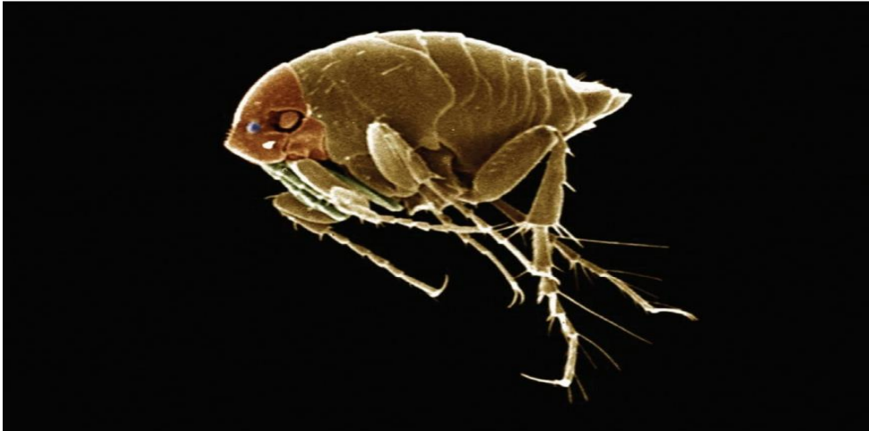
Fig. 1. Female Tunga penetrans [3]