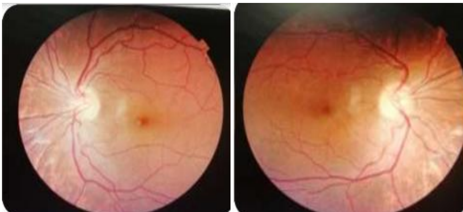
Fig. 3. Retinophotographs of both eyes showing the absence of anomalies in our patient