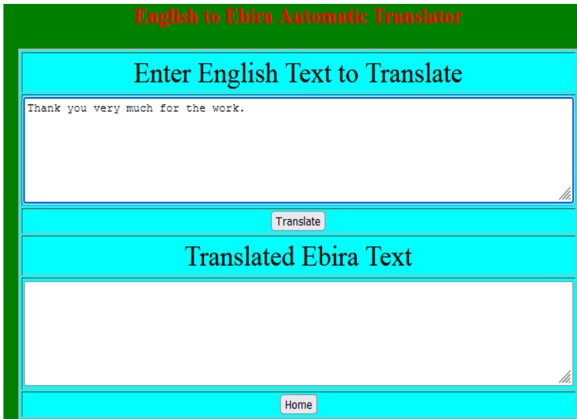
Fig. 2. Sample translation Interface

Enter the text to be translated and then click Translate .