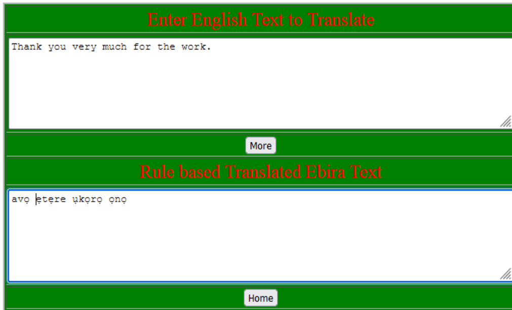
Fig. 3. Sample translation Interface

After entering the text to be translated and then click Translate , the result is shown above.