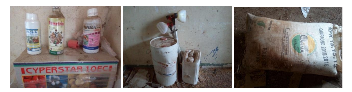
Photo B. Pesticides and fertilizer used by crop producers irrigate around Lake Guidimouni

Siradji et al.; J. Geo. Env. Earth Sci. Int., vol. 26, no. 12, pp. 81-89, 2022; Article no.JGEESI.95953