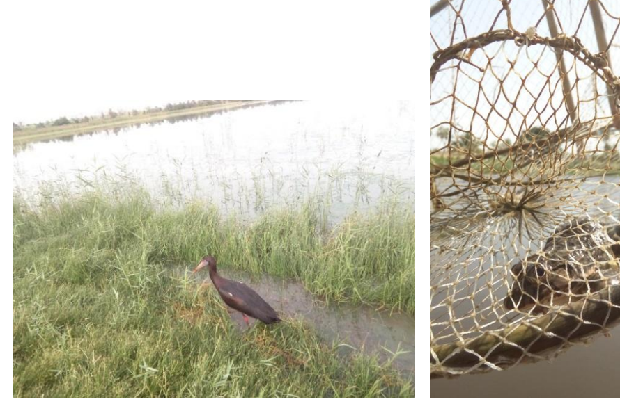
Photos A. Ciconia nigra and frog trapped by a poacher by the lake.

The study documents based on the focus group discussion the following emerging menaces to Guidimouni which the Lake are: (i) microplastic overexploitation; (ii) pollution (Presence of the plastic waste in the lake); (iii) illegal poaching as documented by the Photo (a) which shows the black stork (Ciconia nigra) and frog in the trap of illegal poacher as reported to us by the people we met during the field observation. (iii) salinization; (iv) chemical pollution caused by the use of chemicals (pesticide and chemical fertilizers) which come from irrigated farming activities near the lake (Photo b); (v) climate change represented by drought as reported by the respondents; (vi) plant invasion (Typha australis Schum et thonn and Prosopis juliflora (Sw.) DC. (Photo c), (vii) deforestation which leads to silting up of the lake as illustrated in the Photo (d).