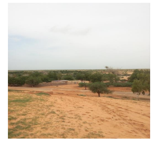
Photo d. Shows deforestation near the lake which leads to the silting