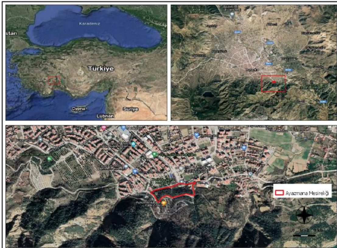
Fig. 1. The location of Ayazmana recreation area

The PCE-NDL 10 sound meters, with data recording features were used. Measurements were made at two different seasons (October 2020 for Autumn and March 2021 for Spring) on different days of the week and at different times of the day. It was measured for 10 minutes of duration at each measuring time. During these experimental measurements, Lmin (Lowest Sound Level), Lmax (Highest Sound Level), Leq (Equivalent Noise Level) values were noted. After collecting noise values sufficiently, noise maps for the area were prepared.