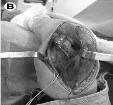
Fig. 1. Triceps- Reflection approach (A, B)