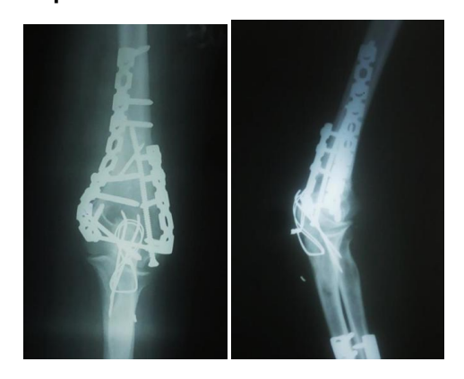
Fig. 4. Case 2-29 yr. old female. MOT: RTA. Type and side: LT distal humeral fracture. Fracture pattern: C3. Associated fractures: none. Time till surgery: 5 days. Approach: Olecranon osteotomy. Follow up X-ray at 6 months. complete union .ROM: flexion-extension 10°-130°. MEPS 100 points