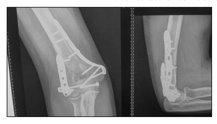
Fig. 3. Case 1- 39 years old male. MBA.RT distal humeral fracture. Fracture pattern: C2. Associated fractures: none. Time till surgery: 4 days. Approach: triceps reflecting, follow up X-rays at 24 months. complete union. ROM: flexion-extension 5°-120°. MEPS 100

The obtained results were statistically analyzed using IBM SPSS software package version 20.0. (Armonk, NY: IBM Corp). Qualitative data were described using numbers and percent. The Kolmogorov-Smirnov test was used to verify the normality of distribution. Quantitative data were described using range (minimum and maximum), mean, standard deviation, median and interquartile range (IQR). Significance of the obtained results was P-0.05value less than.