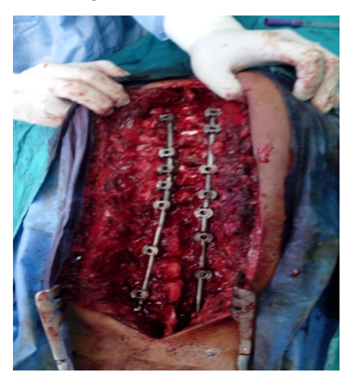
Fig. 3. Rod insertion

Principles of Deformity management: Curve stiffness diagnosed by bending x. ray films, The stiffness of a curve will influence surgical strategy because a stiff curve resists correction by: Posterior articular facetectomy ,Anterior release ,Costal facet releases, Rib osteotomy Anterior release ,Remove ALL/PLL ,Incise disc ,Remove disc, Structural Interbody graft or cage.