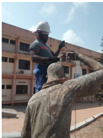
Fig. 4. Passing of electric wire and fixing of the bulb