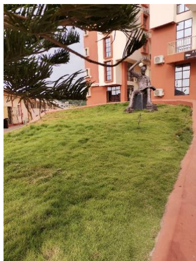
Fig. 6. Greening the sculpture's environment