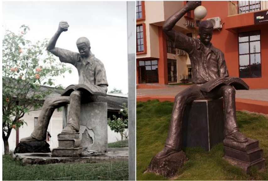
Fig. 7. Before and After Restoration