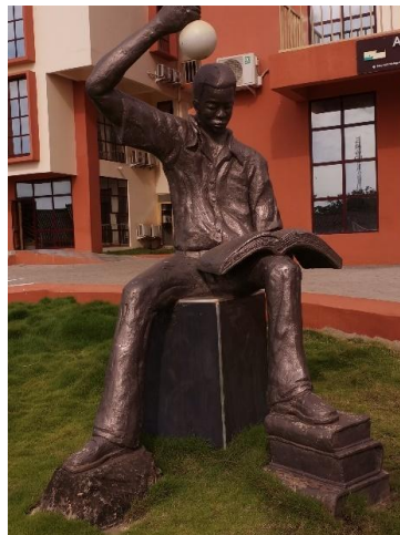
Fig. 5. Application of enamel paint

Before applying paint to the statue, the artists ensured that the statue was free of all forms of dirt by washing it with a soap solution and a duster. It was then allowed to dry for thirty minutes to ensure the paint sticks well to the body of the sculpture. The paint was then applied with a brush onto the statue with a half-gallon of enamel paint mixed with two litres of thinner. The finishing was done to retain the original form of the statue with bronze enamel paint, as shown in Fig. 5.