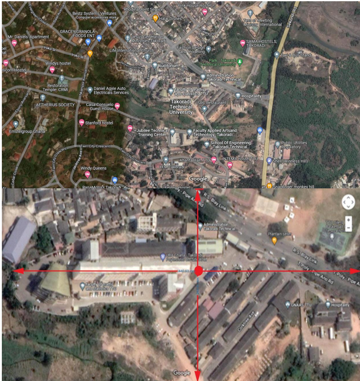
Fig. 8. Location of “The Serious Learner” outdoor concrete statue in TTU, Sekondi-Takoradi, Western Region-Ghana

Location: The artwork is located at the New Oduro Block, TTU (Refer to Fig. 8). The red intersection lines indicate the exact location of the outdoor concrete statue on the map.