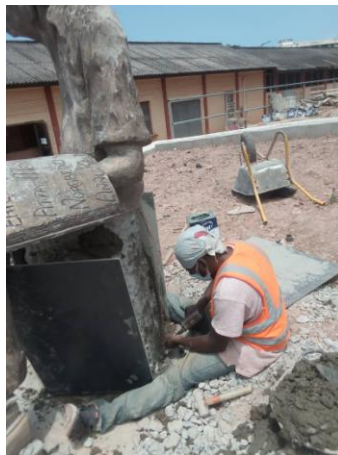
Fig. 3. The artist lays tiles around the pedestal

The artists used electric cable encased in a half ½ inch PVC pipe through "The Serious Learner" concrete statue from the pedestal and to the right hand of the figure holding the lamp. The artists prepared the ground by creating a pipe-laying channel from the statue to the source of tapping electric power at the Oduro block. The bulb was fixed to the right hand of the sculpture (The Serious Learner) to complete the lighting process. Fig. 4 shows the process of passing electric wire and the fixing bulb to the statue.