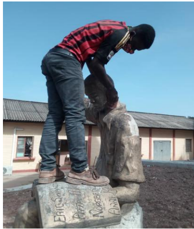
Fig. 1. Surface preparation of the outdoor concrete statue