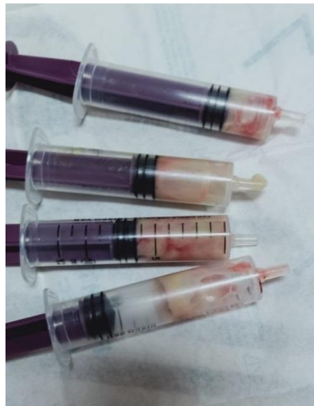
Fig. 3. 10 ml thick pus aspirated with USG guided needle aspiration

As per available literature airway obstruction has been found to have inverse relation with the age of the child with mean age of presentation 1.4 years [11]. Another study found the same to be commonly related with children less than 2 years [12]. The commonest complication of RPA as