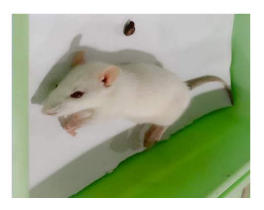
Fig. 2. Pentylenetetrazole induced convulsions in Swiss albino mice

of deaths in 24h) will be recorded. Absence of an episode of clonic spasm of at least 5 seconds duration indicates the extract or a compounds ability to abolish the effect of PTZ on seizure threshold [8].