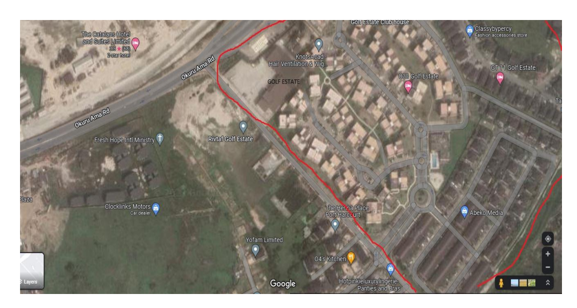
Fig. 2. Imagery of Okuru-Ama Community showing Rivtaf Golf Estate

Port Harcourt Local Government drainage is poor due to low relief, high water table and high relief. The relief has resulted in gentle slopes, which makes the flow velocities of the Bonny River and New Calabar River in Port Harcourt City very low (Izeogu & Aisuebogun, 1989).