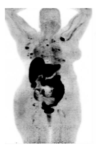
Fig. 3. MIP image showing <sup>18</sup>F-FES uptake in metastatic sites and physiologic uptake in liver, gut and bladder