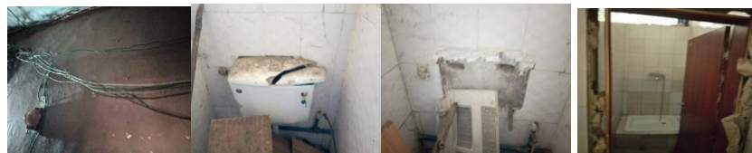
Plate 4. Showing conditions of other facility in the university