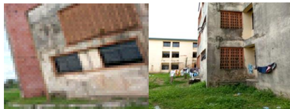
Plate 3. Showing condition of building in Crutech

80(48%) for pull off sockets, 20(12%) for not functioning sockets, 50(30%) and for no idea 15(10%). The number of broken switches witnessed 20(12%), pull off sockets 35(21%), not functioning switches 50(30%), and No Idea had 60(36%). The item on broken walls bracket witnessed 70(42%), pull off wall brackets 15(10%), not functioning wall brackets 20(12%), and No Idea 60(36%). Finally, on unguided cables witnessed no response, pull off cables had 35(21%), not functioning cables 130(79%) while No Idea had no response. This result shows the poor state of affairs of other elements in university of calabar.