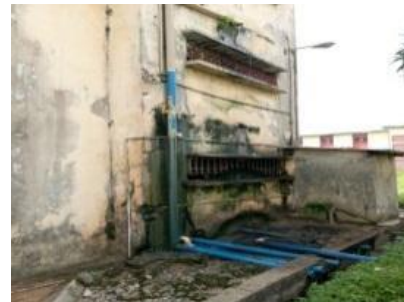
Plate 5. Showing condition of Hostel Building, Cross River State University of Technology

seat, 15(10%) for cistern not functioning, 20(12%) for dismantle and 60(36%) for broken flushing handles. The number of water taps witnessed 50(28%) for leaking pipes, 25(15%) for faulty taps, 55(33%) for pull off taps/showers, and 35(21%) for disconnected water supply. Finally, the item on the sewage system recorded 45(3%) for leaking pipes, 20(12%) for broken toilet seat/cistern, 35(21%) for un-dislodged soak away pit, and 65(39%) for uncovered inspection chamber/pits.