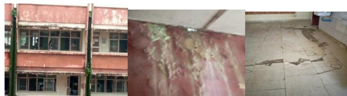
Plate 2. Showing condition of external/internal walls of university of Calabar library building