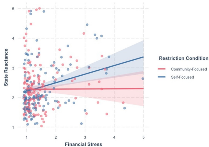
Fig 3. Simple slopes analyses for the interaction between restriction condition (self- and community-focused) and financial stress predicting state reactance to COVID-19 public health restrictions, controlling for gender, psychological sense of community, political orientation, and income. Financial stress was positively associated with state reactance for those in the self-focused condition but was nonsignificant in the community-focused condition.

Finally, reactance was significantly associated with adherence to social distancing guidelines, b = -0.57, p < .001, 95\% \text{ CI } [-0.78, -0.35] . That is, those reporting greater reactance also reported lower levels of social distancing behavior. Overall, the variance explained by the model for state reactance was R^2 = .25 and for adherence to social distancing was R^2 = .18 with an adjusted GFI = .99 for the entire model. This suggests that 25% of the variance in state reactance, reflecting a large effect size, 18% of the variance in adherence to social distancing, reflecting a medium-to-large effect size, and that 99% of the variance in the sample covariance matrix were accounted by the model.