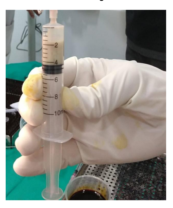
Fig. 4. Appearance of abscess on inspection and amount of pus drained

Drainage of the abscess was performed within 48 hours, yielding around 3ml of pus and we applied pressure dressing. Corticosteroid therapy was added. The abscess improved well after drainage. The bacteria isolated was Staphylococcus Aureus Meti S and were