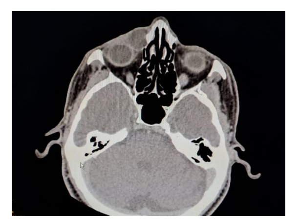
Fig. 2. Orbito-cerebral scan of the patient