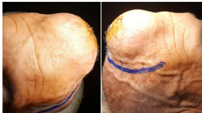
Fig. 1. Pictures showing a sizable mass in the medial frontal region

Further biological evaluation indicated an elevated total PSA level. Subsequent ultrasound and prostate biopsy were conducted, leading to a diagnosis of prostatic adenocarcinoma. Thoraco-abdominal CT scan and scintigraphy did not reveal any additional secondary sites of prostate cancer (PCa). Consequently, the patient underwent a surgical procedure involving subtotal excision of the lesion followed by cranioplasty. The results of the pathological examination confirmed the presence of metastatic prostate adenocarcinoma. The patient was subsequently referred to the oncology department for further management.