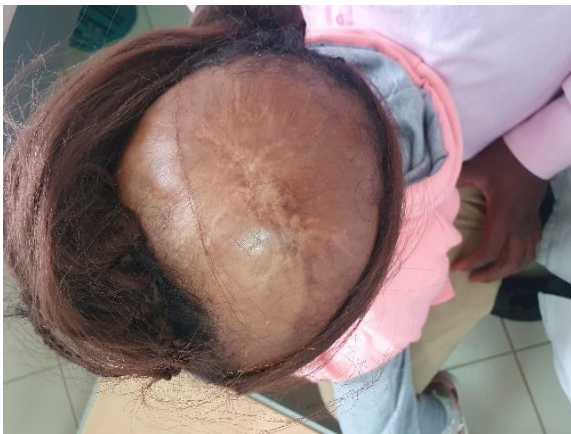
Fig. 3. Evolution after treatment

shaped, oval lesions., with a shiny atrophic membrane with a few hairs visible. This form results from incomplete closure of the ectoderm. It is most often sporadic. In this membranous form, particular forms have been reported, in particular pseudo-bullous forms which have histological characteristics close to those of encephaloceles or meningoceles, which is in line with the recent hypothesis according to which these bullous forms represent forms Frustrations of failure to close the neural tube.