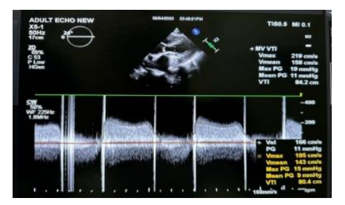
Fig. 6. Post procedure ECHO: Peak/Mean Gradient reduced to 15/9 mmHg