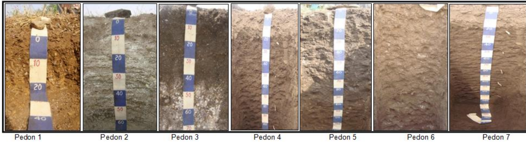
Fig. 2. Landscape-soil relationship and soil profile development in a topsequence