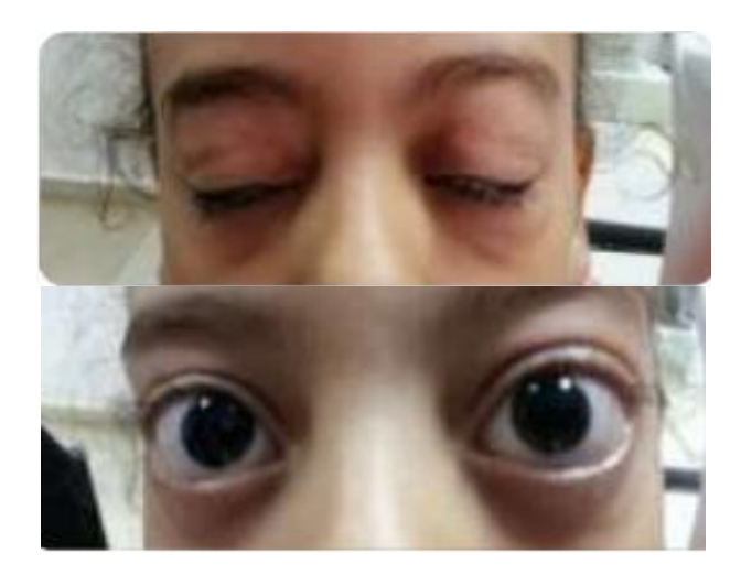
Fig. 1. Photos of the patient showing bilateral signs of Graves' disease: Exophthalmos, palpebral retraction, with minimal edema and irritation of the eyelids

General examination found a heart rate of 160 beats per minute.