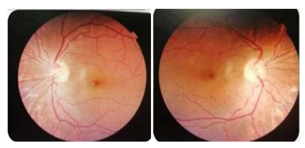
Fig. 3. Retinophotographs of both eyes showing the absence of anomalies in our patient