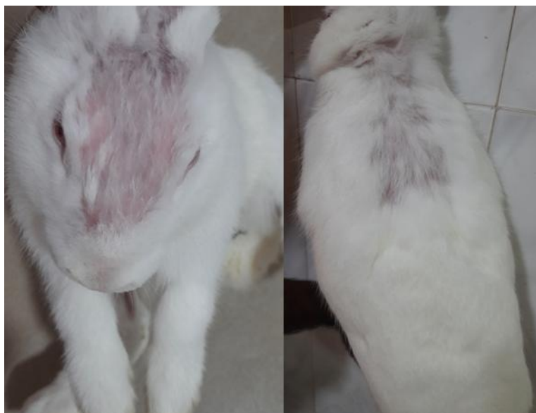
Fig. 1. Erythema and poorly demarcated alopecia on the dorsal neck and face

A 1.5 year old, female New Zealand white rabbit was presented to the Dermatology Unit with the history of alopecia on the face and dorsal neck for the past two weeks. The rabbit was housed in an indoor cage and fed with commercial food. The rabbit had no previous history of illness or itching. On physical examination, the rabbit appeared active and alert and was in good body condition. On dermatological examination, the rabbits had erythema and poorly demarcated alopecia on the dorsal neck and face region (Fig. 1). No other abnormalities of skin and hair coat were detected.