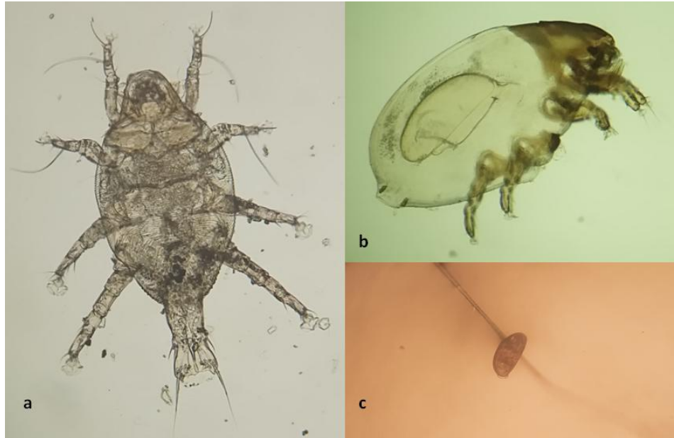
Fig. 2. a. Male L.gibbus mite with two elongated adanal processes (40x) b. Female L.gibbus mite with highly sclerotised gnathosoma (40x) c. Egg of L.gibbus (10x)

Microscopic examination of the collected material by deep skin scraping was negative while coat brushings revealed adult L. gibbus males and females, and eggs of the parasite (Fig. 2). No other mite species were visualized. Skin cytology and fungal culture were both negative for bacteria and fungi. Haematology and serum biochemistry values were within normal limits (Table 1).