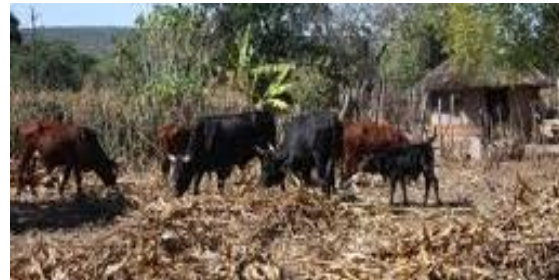
Fig. 2. Cattle feeding on Mulch