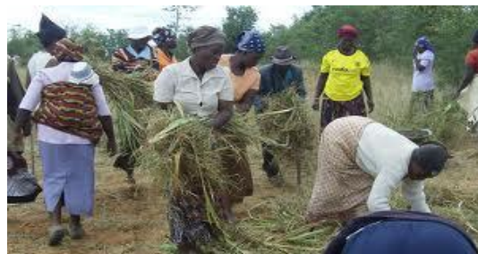
Picture 1. Farmers working at a demonstration field

'These demonstrations help me as I cannot read and write. I am able to observe and practice exactly how the innovations can be done. This makes it easier for me to follow and do the same at my own field. I am also doing exactly the same in my field as this program has increased my yields compared from the past where I used to plant without applying some mulch'.