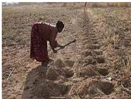
2.(b) Farmer making basins Picture 2. Please insert caption

All farmers interviewed complained about winter weeding. They believe it is not necessary to weed in winter as livestock would graze whatever is in the fields as shown below on Fig. 2 where