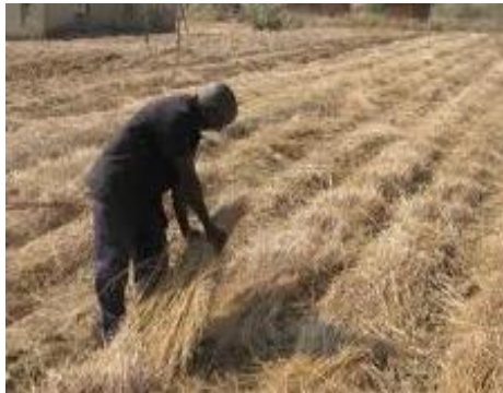
2.(a) Farmer applying mulch

This was also echoed by other farmers interviewed when they say that moisture conservation innovation is so demanding that if followed exactly according to book you grow thin until you die. However, some of the farmers were seen in the field applying some mulch and digging basins as shown below although some complained that the work is too much.