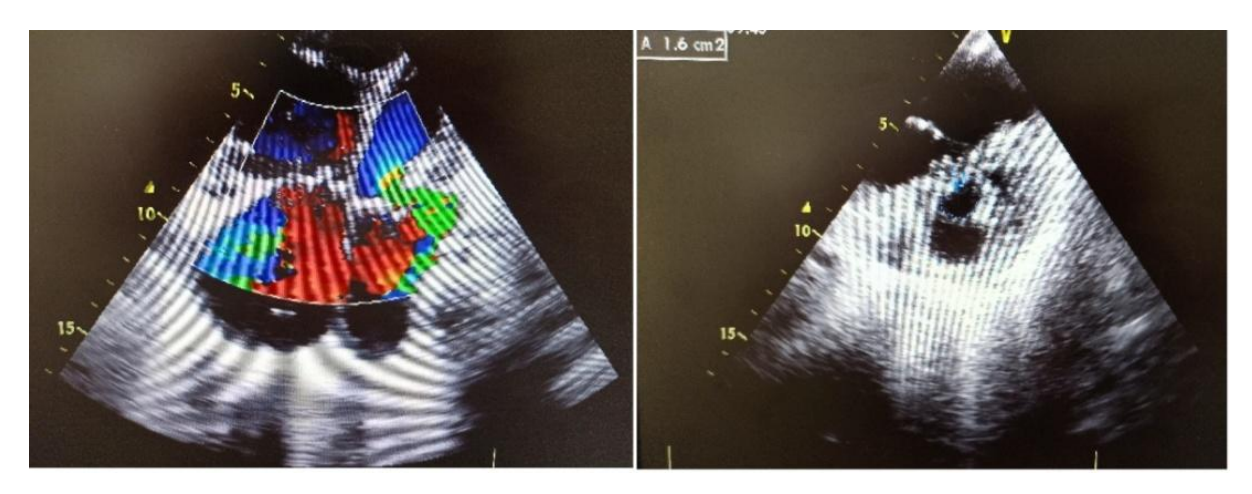
Fig. 3. Post BMV eccentric MR due to AML tear and mitral valve area by planimetry post BMV

In view of the AML tear and patient hemodynamically stable, he was semi emergently transferred for mitral valve repair to cardiothoracic and vascular surgery department but as the valve had severe fibrosis, mitral valve replacement was done with St Jude Medical 25 bileaflet valve. Post operatively patient recovered and was discharged on oral anticoagulant warfarin titrated to optimal PT/INR.