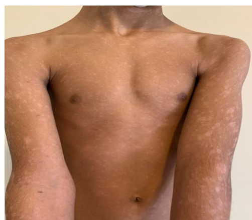
Fig. 2. Extension of the macular lesions at the trunk and the limbs