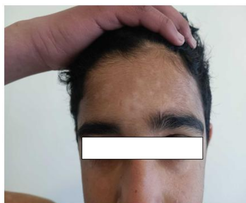
Fig. 1. Hypochromic macular lesions, very finely scaly, and non-pruritic, located essentially at the face

repigmentation of some lesions was noted after 3 months of therapy. The patient was followed for 2 years during which he did not present any malignant transformation.