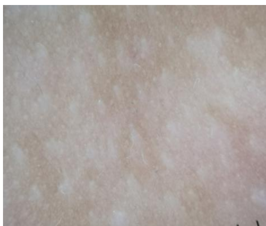
Fig. 3. Dermoscopy showed hypopigmented areas poorly limited without any particular pattern