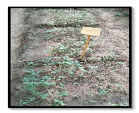
Fig. 2. Seedlings in nursery beds