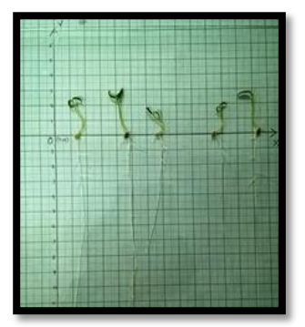
Seed priming with KH<sub>2</sub>PO<sub>4</sub> (T<sub>8</sub>)