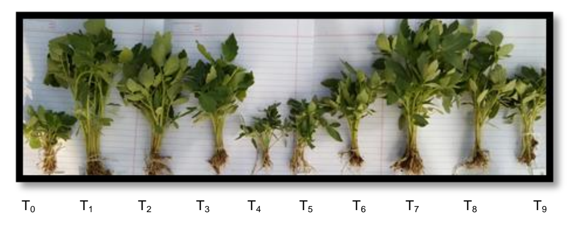
Fig. 3. Seedlings vigour in field