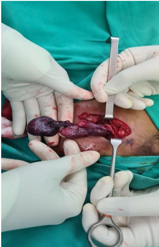
Fig. 3. After detorsion of the cord done, right testes non-viable hence done right orchidectomy

Testicular torsion is a surgical emergency and its incidence peaks about 12-16 years of age which corresponds to our patients age group [3]. Torsion of UDT remains a rare clinical entity thus poses difficulty for the treating physician [3]. The problem is further compounded by atypical presentation and misdiagnosis. The lack of awareness for this condition amongst patients, parents and medical practitioners may further contribute to late presentation to hospital and poor salvage rate [4,5]. As in the case discussed above, patient presented after 3 days of pain, which is far from golden time of 12 hours which translates to a poorer outcome.