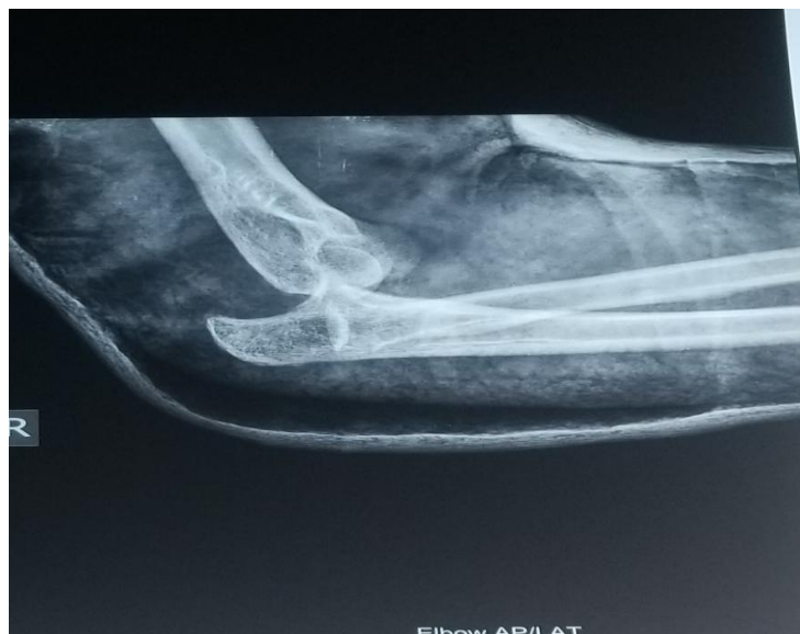
Fig. 1. Anterior/Lateral view of the Right Elbow showing the dislocated elbow. The coronoid and olecranon processes are also visible

The lateral Kocher approach was used with the aim of fixing the radial fracture which was noticed to be healing with good callus formation as the patient presented 2 months post injury and the lateral collateral ligament was intact intra-operatively. An anterior medial approach was not made to repair the coronoid fracture as it only involved a small coronoid fragment. The elbow joint was reduced intra-operatively with the use of C-arm guidance as obvious anterior instability was noticed. The right olecranon was fixed by osteosynthesis and the ulnohumeral subluxation was seen and stabilized with Kirschner wire [Fig. 3]. The right elbow was placed in an arm sling and after 1 week of hospital care he was discharged home. Four weeks later post operatively the Kirschner wires were removed and he was assessed for range of motion.