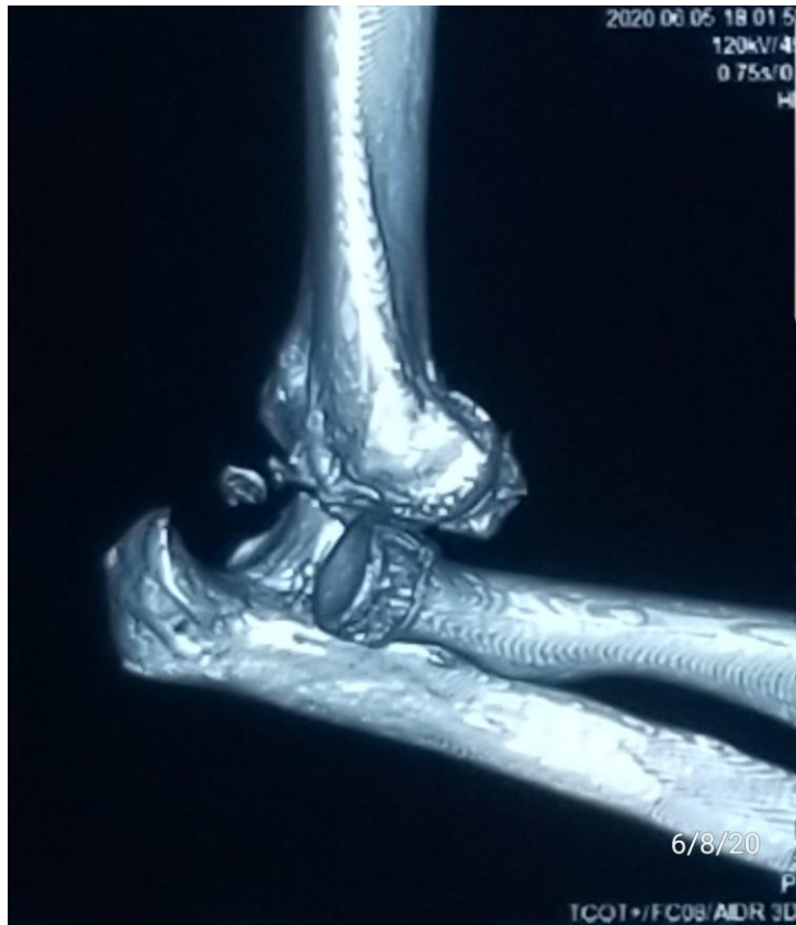
Fig. 2. CT scan of Right Elbow showing the dislocated elbow