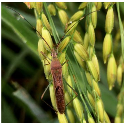
Fig. 1. L. oratorius