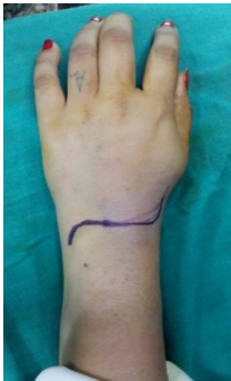
Picture 1. Incision over dorsal aspect