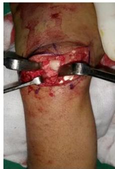
Picture 2. Superficial and deep dissection