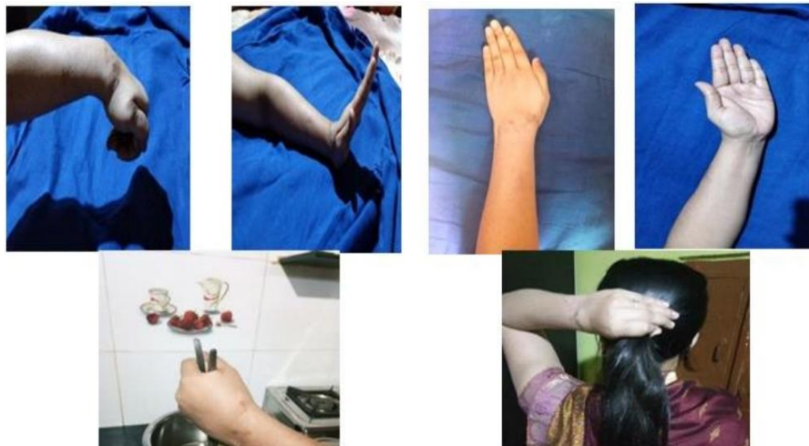
Fig. 1. Range of movements recovery