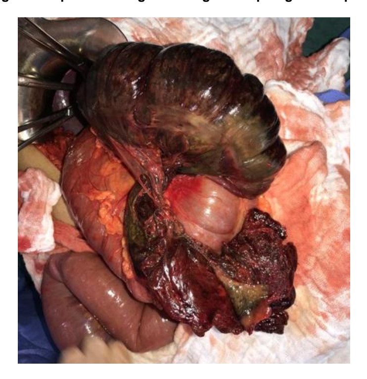
Fig. 5. Peroperative image after reduction of the herniated necrotic colon