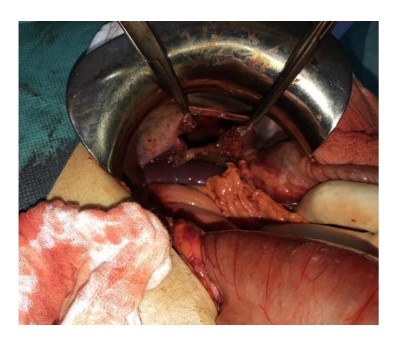
Fig. 4. Peroperative image showing the diaphragmatic rupture