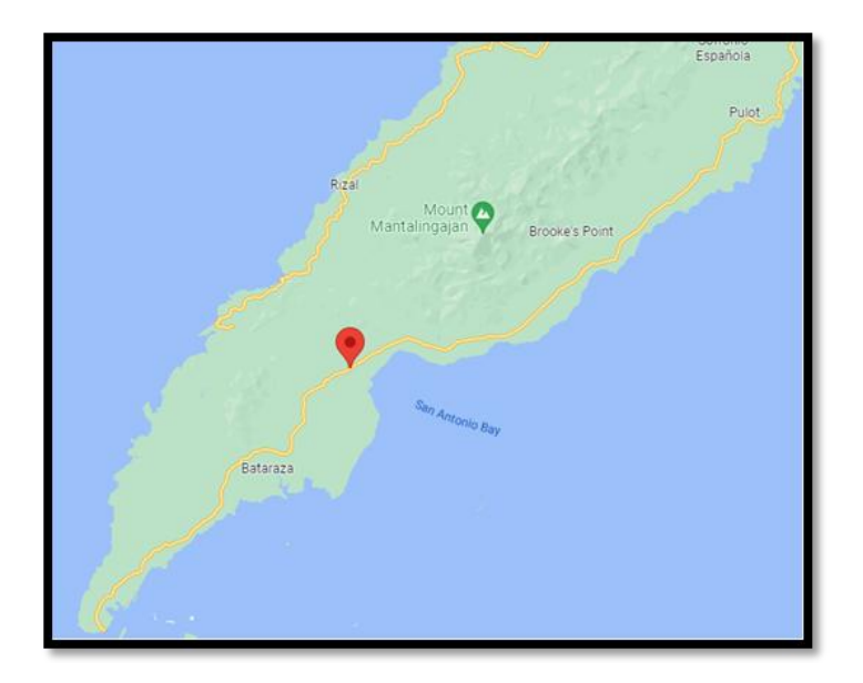
Fig. 1. Map of Southern Palawan showing the Municipality of brooke's point, Bataraza and Rizal. Baranggay Tarusan is shown in the red Marker. (Image edited from Google Map)

The Pala'wan community where the study is conducted is part of the impact areas of Rio Tuba Nickel Mining Corporation and Coral Bay Nickel Corporation; thus, the community Minina receives a share of the income of the mining operation. Among the programs enjoyed by the community is the Indigenous Learning System (ILS). This alternative delivery mode of education is accredited by the Department of Education's Alternative Learning System (ALS). The mining companies have also sponsored cultural activities in the community. One of which is the building of "Bahay Tarukan." This structure was made to preserve the cultural properties of the community. Its design and function are derived from the Pala'wan traditional house referred