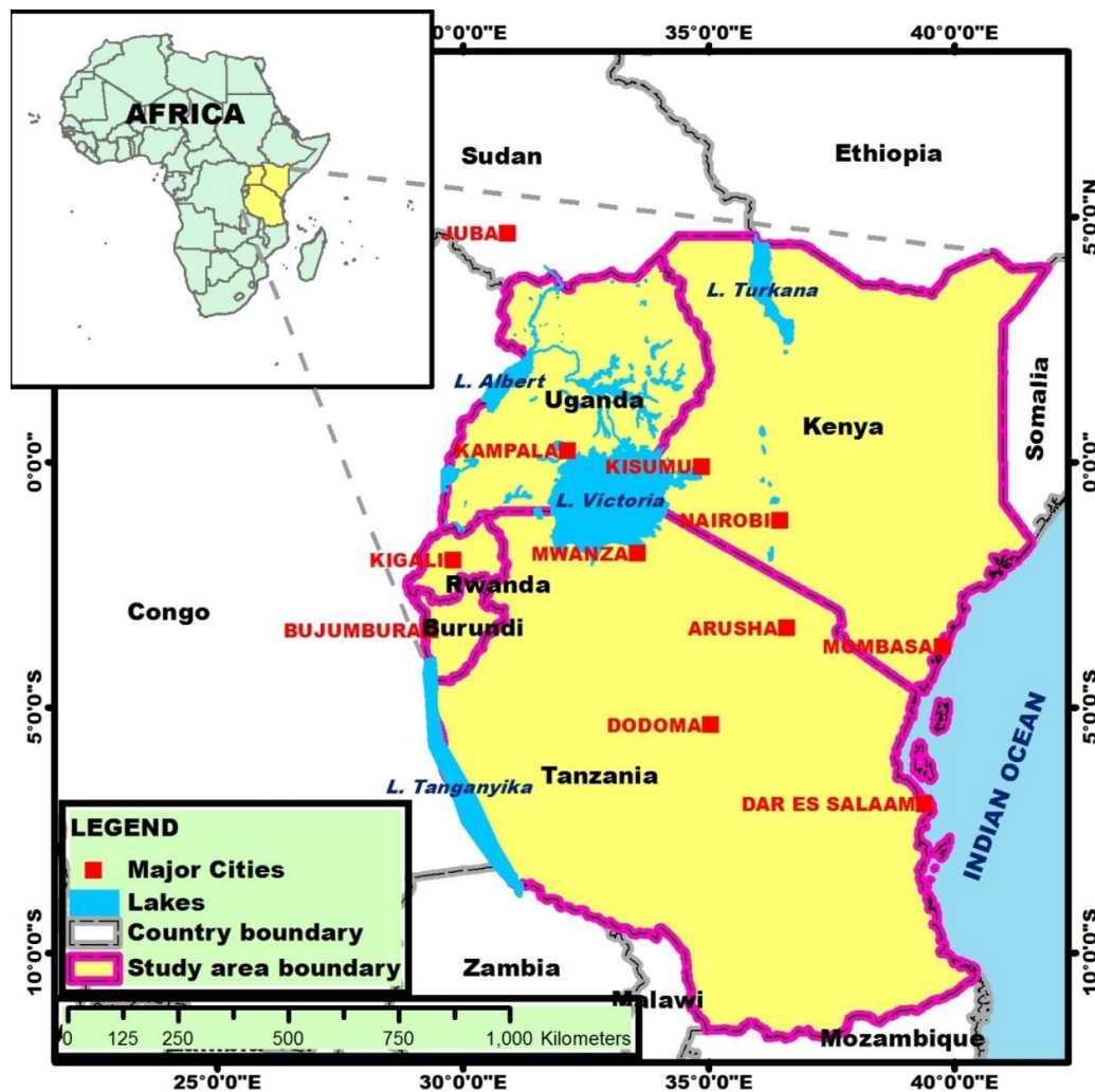
Fig. 3. Map of East Africa Showing the Study Sites

between study variables. Hausman test [24] was applied to choose the best estimation method between fixed and random effect. However from analysis null was rejected and fixed effect chosen (Table 5). Unit root test is important to make sure all variables are stationary to avoid misleading result. The study adopted Levin Lin, and Chu (LLC) test which adopt augmented Dickey–Fuller test estimation for each cross-section with individual effects and controls for time trend [25]. To test for long run relationship the study employed Pedroni cointegration approach [26]. Finally diagnostic examinations were tested to assess the validity of the panel regression analysis and to reduce endogeneity issues in the study. The main tests include heteroscedasticity and autocorrelation.