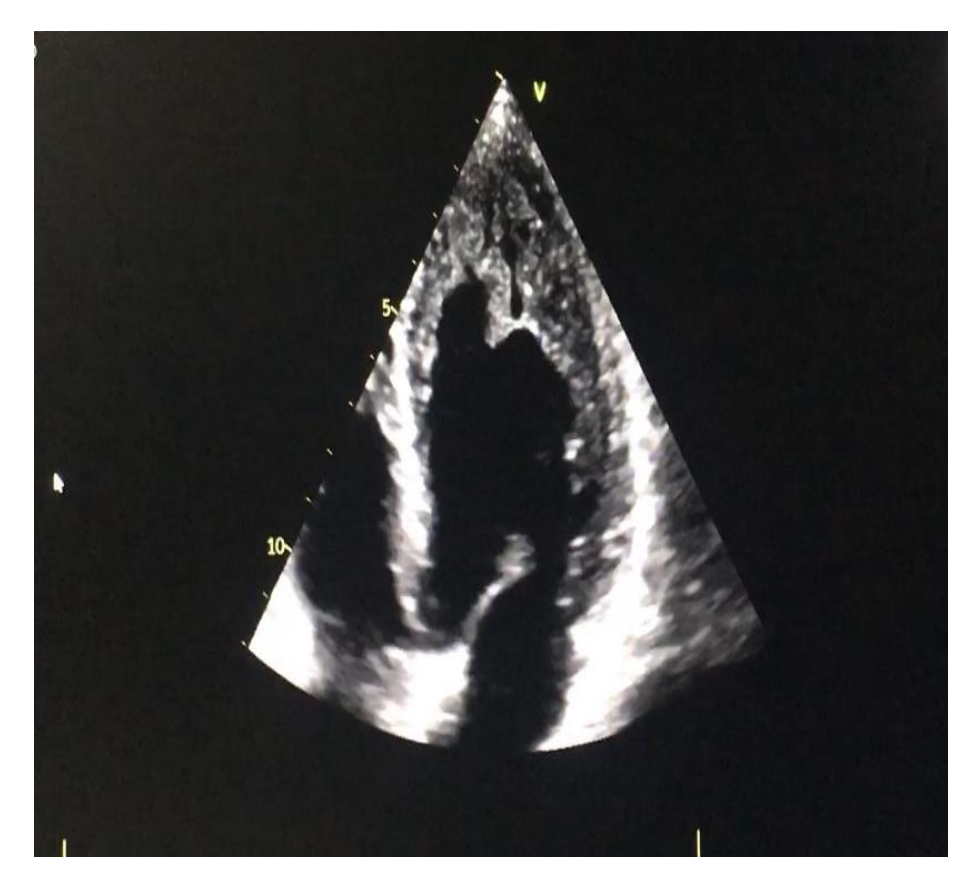
Fig. 1. Apical 4-chamber echocardiographic section showing a trabeculated aspect of the apex of the left ventricle