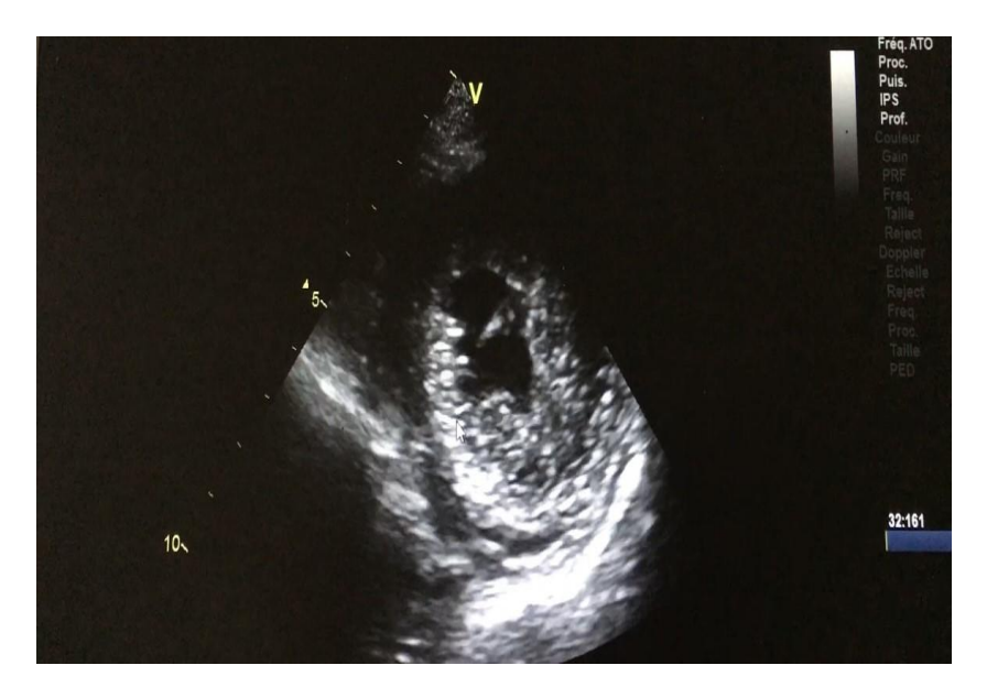
Hanane et al.; AJCR, 7(4): 75-81, 2022; Article no.AJCR.94378