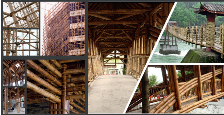
FIGURE 1: Bamboo as a structural element.