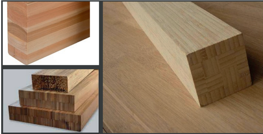
FIGURE 3: Engineered bamboo products.