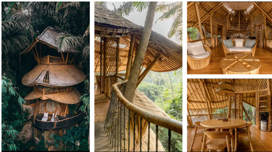
FIGURE 2: Aura House, 2bds eco bamboo house.

considerable deflections before collapsing, and as such, it is safer under Earth tremors. As a result of the conveniences mentioned above, there is driving interest in developing bamboo as a sustainable material in contemporary buildings to reach the growing urban demand.