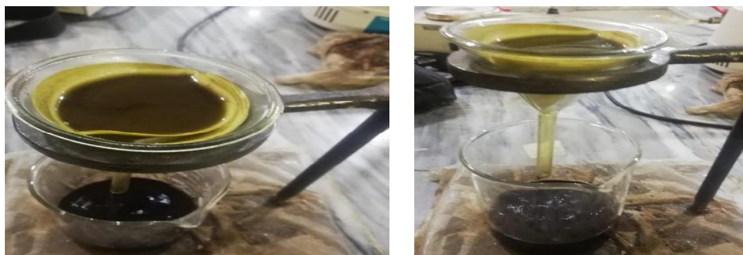
Fig. 1. Preparation of leaf extract of Cryptolepis buchanani